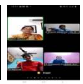
CBSE Activities for the month of November 2021 Poshak show on the theme of attire of regional costume of Sikkim